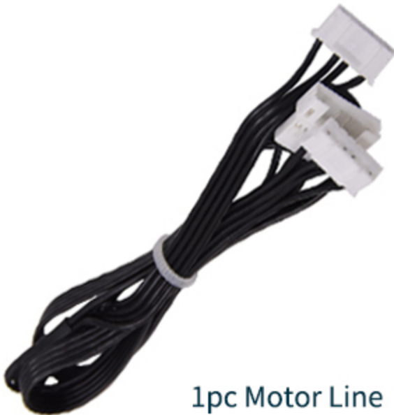
1pc Motor Line