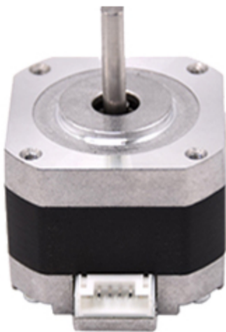
1pc 42-34 stepper motor