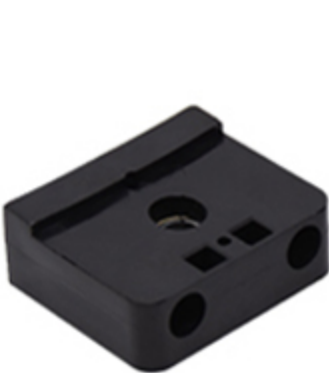
2pcs Z Lead screw Bearing Bracket