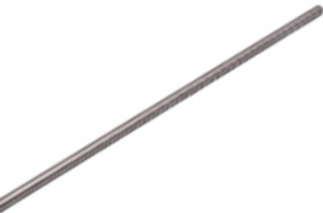
1pc T8-L-365mm Lead 8mm Lead screw