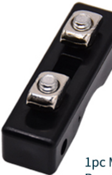
1pc Motor Bracket