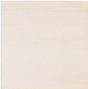
Spare Wood Board Pad*3