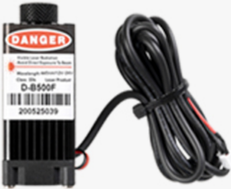
12-24 V laser head*1